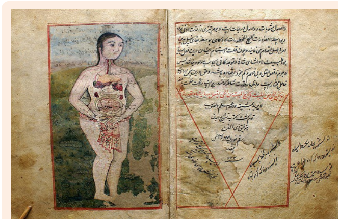
Figure 2: Illustration of Fetus and Heart, Lung and Kidney from Tashrihi Mansuri.