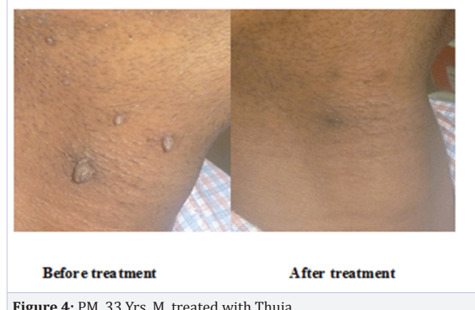
Figure 4: PM, 33 Yrs, M, treated with Thuja