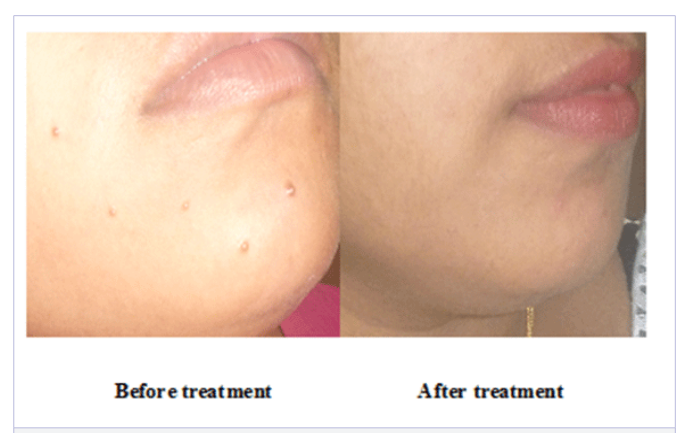
Figure 3: MD, 23 Yrs, F, treated with Dulcammara