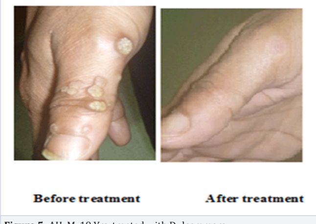
Figure 5: AH, M, 19 Yrs, treated with Dulcammara