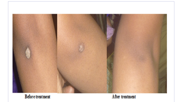
Figure 2: TK, 20 Yrs, M, treated with Dulcammara