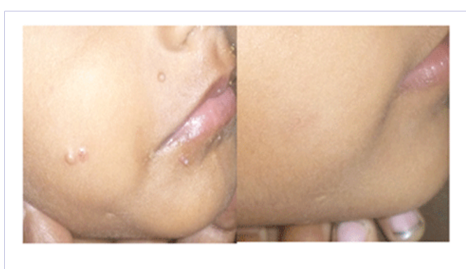
Figure 1: YRS, 4 years, F, Treated with Dulcammara

less than 0.0001 (t value was 27.80). Similarly the two-tailed P value of differences between duration of remission in between delayed recovery cases (N=12) and control cases (N=10) was also less than 0.0001 (t value was 5.24). By conventional criteria, both the differences are considered to be extremely statistically significant.