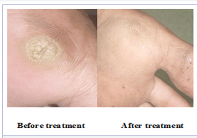
Figure 7: AH, M 19 Yrs. Treated with Natrum mur