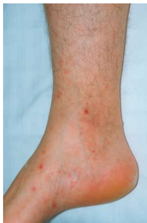
Figure 2 Small purpuric lesions on the legs, suggestive of septic vasculitis.

Rat bite fever must be suspected in patients presenting fever, polyarthralgia, and polymorphic cutaneous lesions of rapid onset. 1 There is a possibility of underdiagnosis in Spain, as low levels of clinical suspicion mean that specific questions about prior contact with rodents are rarely included in the history.