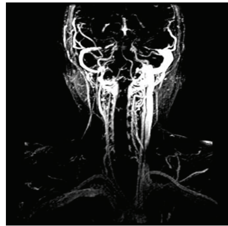
FIGURE 3: Sagittal view of collateral system (dynamic magnetic resonance image).

may also coexist with the thrombosis of IJV [10–12]. Our patient did not have any of the abovementioned conditions and thrombosis antecedently. The ultrasonography, CT, and magnetic resonance imaging did not reveal any thrombosis and showed congenital agenesis of the IJV.