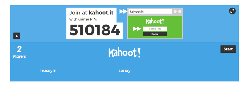
Fig. 4. Participation of students in the game

3) Students join the game: Students do not need to sign up. They can directly play the game. A randomly created password is shown on the screen of the teacher connected to the projection. The password given after how the students will join the game is explained will be valid for this session only, and a new password will be created for each game. Students are expected to log in on <u>kahoot.it</u>, write their password and then write their "nicknames" for the game and enter the game. The names and number of the students who entered the game are shown on the screen of the teacher, as shown in Fig. 4. After all the students join the game, game is started by Start Now button.