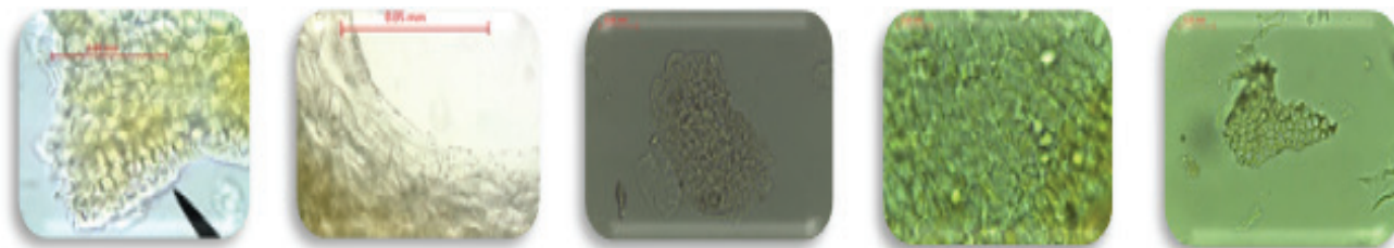
Figure 1: Microscopic examination of samples. a) Epicarp with thick cuticle, collenchymatous hypodermis, b) Fragments of lysisigenous oil glands c) Epicarp with anomocytic stoma-in surface view, d) Fragment of mesocarp containing crystal of calcium oxalate, Mesocarp.

Microscopic elements of fruit were given Figure 1.