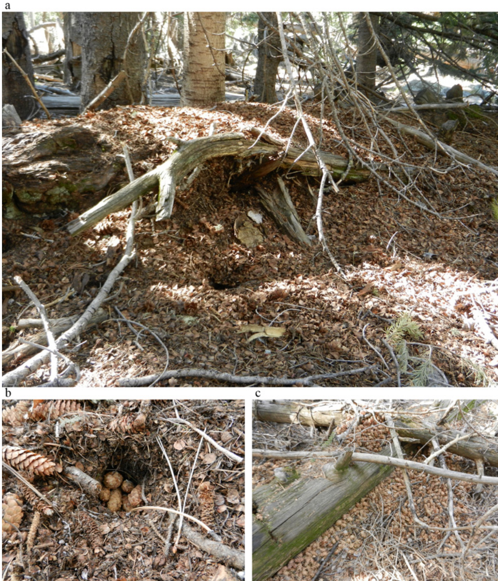
Fig 1. Red squirrel ( Tamiasciurus hudsonicus ) midden. Photographs of (a) red squirrel ( Tamiasciurus hudsonicus ) midden cone-scale pile, (b) cached cones inside pit excavated by red squirrel, and (c) stored cones, which may number in the thousands at a single midden. Mt. Graham, Graham Co. Arizona, 2011–2012.