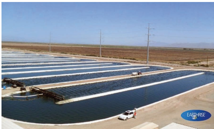
Figure 3. Spirulina culture in open raceway ponds at Earthrise® company, US. (Permission granted for use of photo).

In the choice of culture systems, it is not only the microalgae strain that is important but also the reason for the culture. In case of biofuel production, culture should preferably rely solely on freely available sunlight irrespective of weather conditions to be economically viable. 12 Many factors have been identified as potential threats to microalgae culture such as light source, nutrients, temperature and others as discussed in the Nutrition and culture conditions section. For pilot-scale and commercial scale productions, raceway ponds remain the easiest and most applicable option due to the ease of setup. 116 Raceway ponds basically consist of a closed and looped channel that is driven by a paddle wheel while the liquid flow is guided by baffles. 12 The whole system is exposed to sunlight and the paddle wheel operates to prevent the occurrence of sedimentation. Due to their simple assembly, raceway ponds can be easily scaled up. 117 The supply of CO 2 is an excellent method of aeration and helps increase biomass production. 118 These ponds are usually shallow to allow