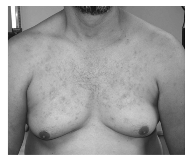
Figure 3. Gynecomastia.

nomenon or a sign of an underlying disease.<sup>9,10</sup> The prevalence of gynecomastia in cirrhotic patients was reported in one study to be 44%.<sup>10</sup> True gynecomastia is characterized by palpable glandular tissue, especially around the areola. Lipomastia is breast tissue enlargement from adipose tissue and is not a pathologic finding.