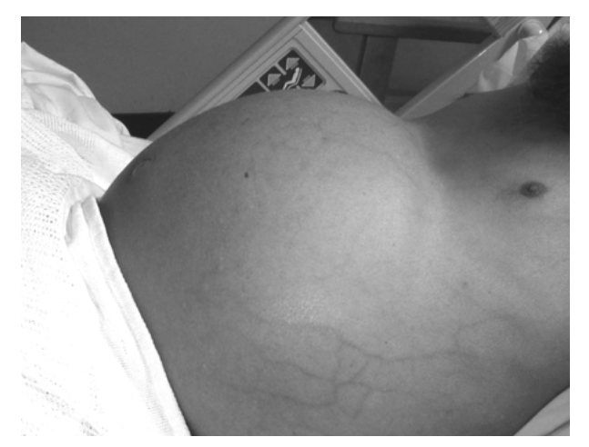
Figure 4. Tense ascites.