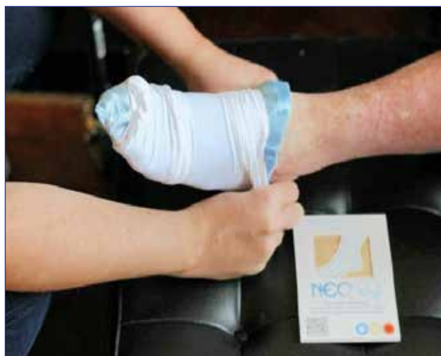
Figure 1. Neo-slip in use