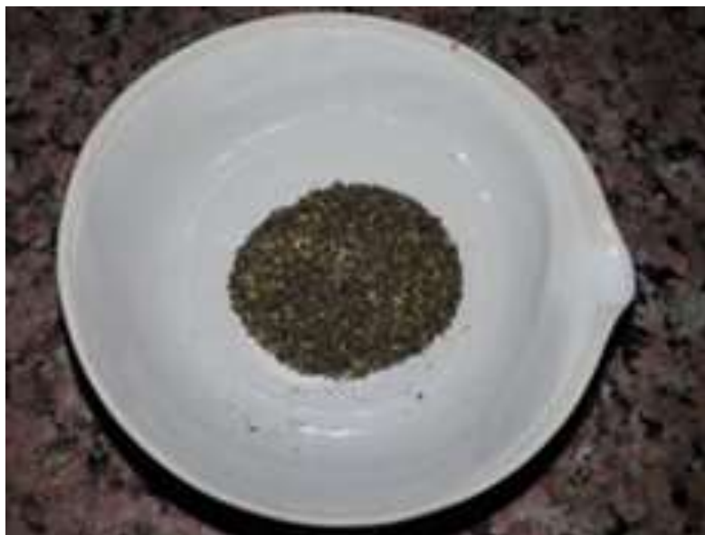
Fig. (4). Green tea.

Gram flour, commonly known as Besan in Fig. (5), has been used extensively since the olden times for its beauty-enhancing benefits. It mainly acts as a tonic for the skin as it helps to clean and exfoliate it. Gram flour is nothing but a pulse flour obtained from grinded chickpeas. It is very beneficial for skin as well as hair. It is used to decrease tanning of the skin, also reduces the oiliness of skin, thus proving as a good anti-pimple agent. It lightens the skin tone, therefore used as an instant fairness agent [12].