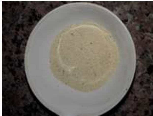
Fig. (7). Prepared face pack.

The powdered constituents were sieved using #40 mesh and mixed homogenously in Fig. (7) for uniform formulation. It was then kept in a moisture-proof container in a cool place for the purpose of standardization of various parameters [15 - 17] (Table 1).