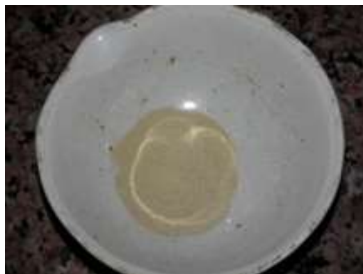
Fig. (1). Multani mitti.

Fig. (1) multani mitti which helps to remove the impurities in the form of dead skin cells. It helps to make the skin radiant. It has been proven best for the irritation-prone skin. Its soothing action calms the skin, cures the inflammation caused due to elevated phlogistic agents. It is perfect for oily skin. It removes the dirt and excess of oil by acting as a perfect adsorbent. It provides fresh, radiant and glowing skin [8].