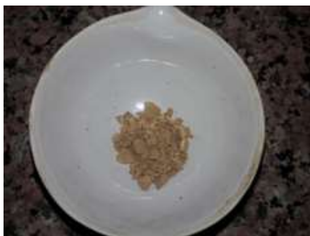
Fig. (3). Santalum album.

White Sandalwood powder in Fig. (3) is used to cure various skin allergies. It has cooling and soothing action. It protects the skin from environmental pollution and keeps it glowing, fair and healthy. Sandalwood possesses antimicrobial properties, therefore it is used to cure various skin problems and also removes scars, acne etc [10].