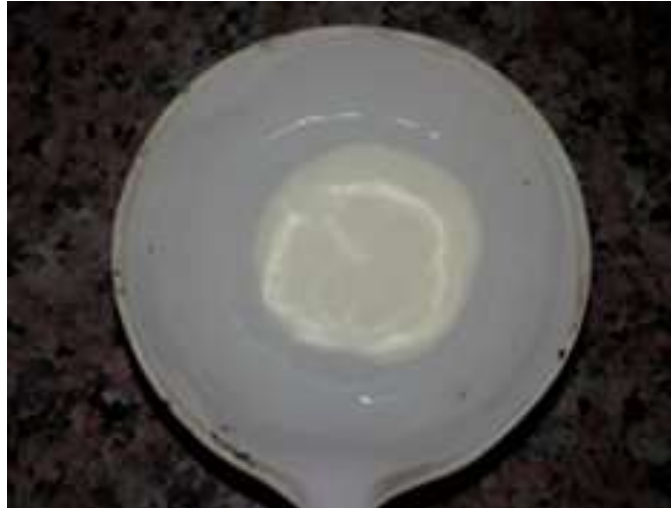
Fig. (6). Milk powder.

It is very beneficial for skin, as it provides nourishment for dry, rough skin for the longer duration. Milk cream either in the form of powdered raw milk in Fig. (6) or milk as such provides a brilliant shine to skin. This is beneficial in hydrating the face deeply and makes skin youthful, lustrous and flawless. It bleaches the skin to remove dark spots, pigmentation, acne etc. This pack also removes blackheads, whiteheads, and other skin imperfections naturally. This facial pack helps in fading sun tan [14].