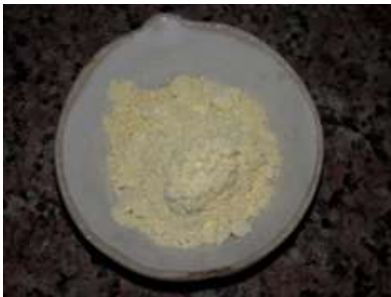
Fig. (5). Gram flour.

Mainly consists of dried stigmas and upper parts of styles of plant known as Crocus sativus in Fig. (5), belonging to the family Iridaceae. It is rich in carotenoid glycosides, mainly containing terpenoids. It lightens the skin tone and provides fair and glowing skin [13].