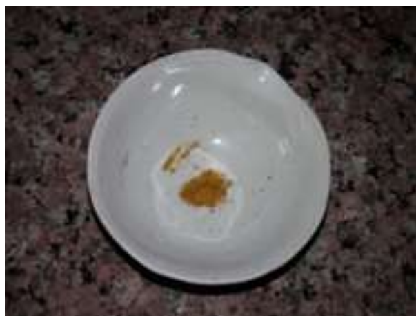
Fig. (2). Turmeric.

Haridra in Fig. (2) has been used in this preparation due to its blood purifying property and helps in wound healing, because of its antiseptic action. It cures the skin diseases occurring due to blood impurities. It is a very good anti-inflammatory and anti-allergic agent. The phytoconstituents, mainly terpenoids present in it helps to lighten the skin tone. Haridra delays the signs of aging like wrinkles, improves skin elasticity. It cures pigmentation, uneven skin tone and dull skin [9].