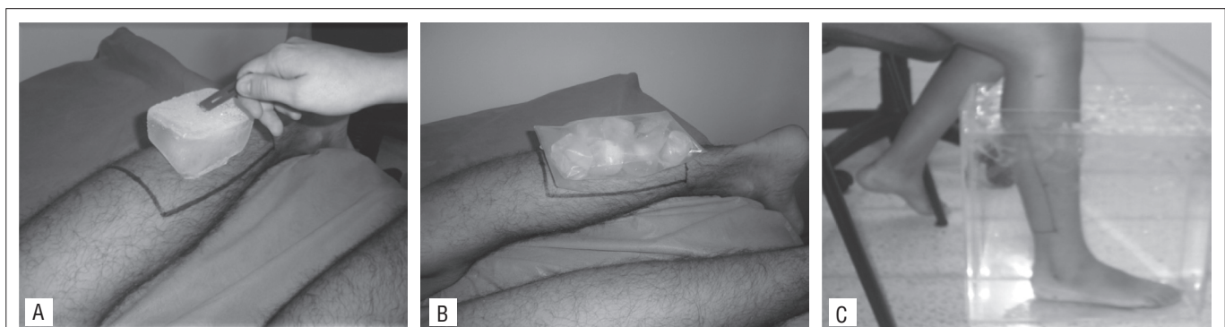
A) Ice massage, B) Ice pack, C) Cold water immersion. The ice massage and ice pack were applied to the same rectangular area (18x8cm) of the calf. Ice massage was performed by continuous longitudinal displacements. The ice pack was placed directly on the skin and without compression. For the cold water immersion, the participants immersed their right leg in a cold water tank as far as the top border of the rectangle used to delimit the cooling area of the other two modalities.

In this phase, the subjects performed one of the randomly determined activities. Half of the subjects from each modality group ( n=6 ) remained resting and lying prone on an exam table for 30 min. The other half ( n=6 ) walked for 15 min and then rested for 15 min in the prone position. NCV was then reassessed at 30 min post-cooling (Figure 1). The walking exercise was carried out in a 9.45 m 2 area at a frequency of 90 steps/min, which was controlled by a metronome, i.e., the subjects stepped at each "click" of the device.