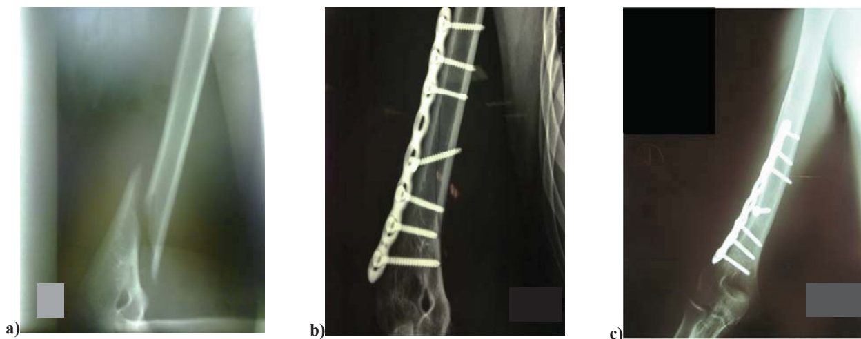
Fig. 1 – Patient A: a) preoperative radiography done at the Emergency Room Department on the day of injury; b) and c) postoperative radiography.