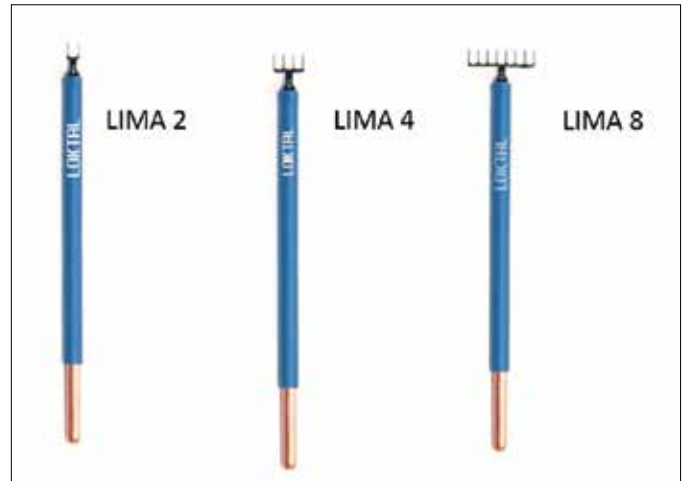
FIGURE 1: Lima 2, 4 and 8 electrodes

Records of 12 women and 7 men with aging of the periorbital region were evaluated. The studied patients had undergone treatment with MPRF, performed in an outpatient setting by the same physician, between January 2015 and July 2015. Photographic documentation was carried out with the same digital camera under the same environmental conditions, im-