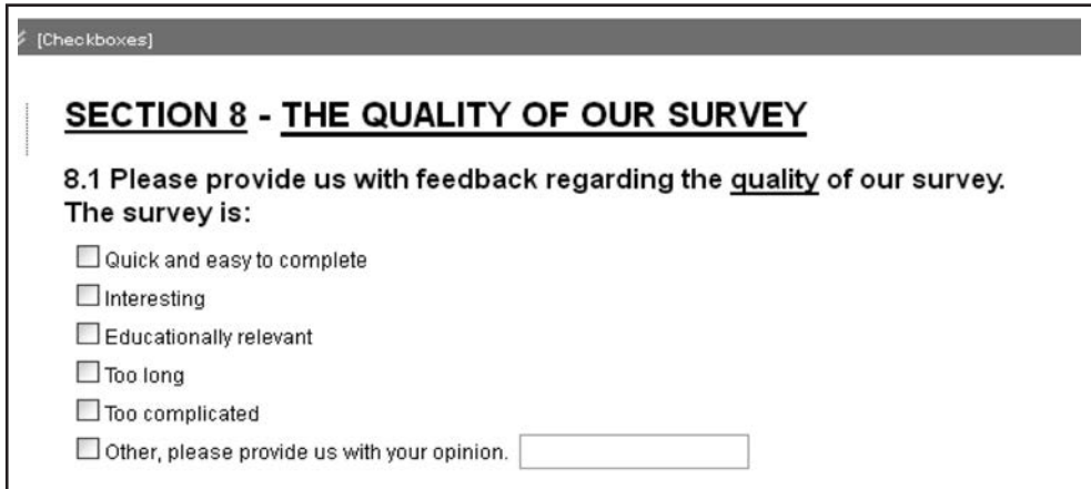
Figure 1: Checkbox question concerning the quality of the survey