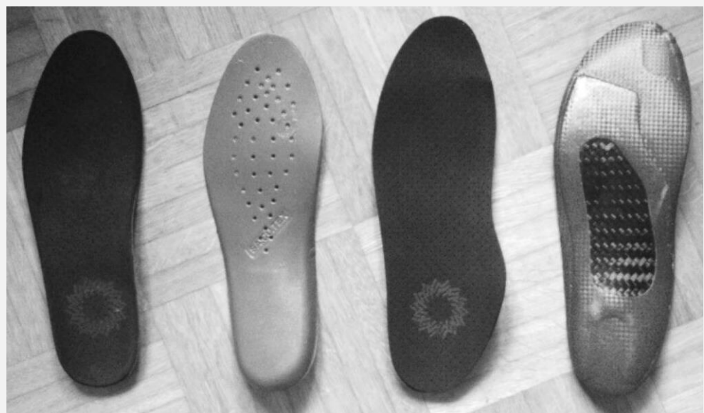
Figure 1. Placebo and cycling shoe insoles, back and front (left: placebo insole, right: carbon insole).

Between the various WAnTs, the athlete paused 10 minutes (active rest) plus 2 minutes for adaptation after the insole switch, which took 2 minutes as well. The resistance during the adaptation phase was 100 W. The relevant parameter was mean power and peak power during the WAnT. The test design is shown in Figure 2.