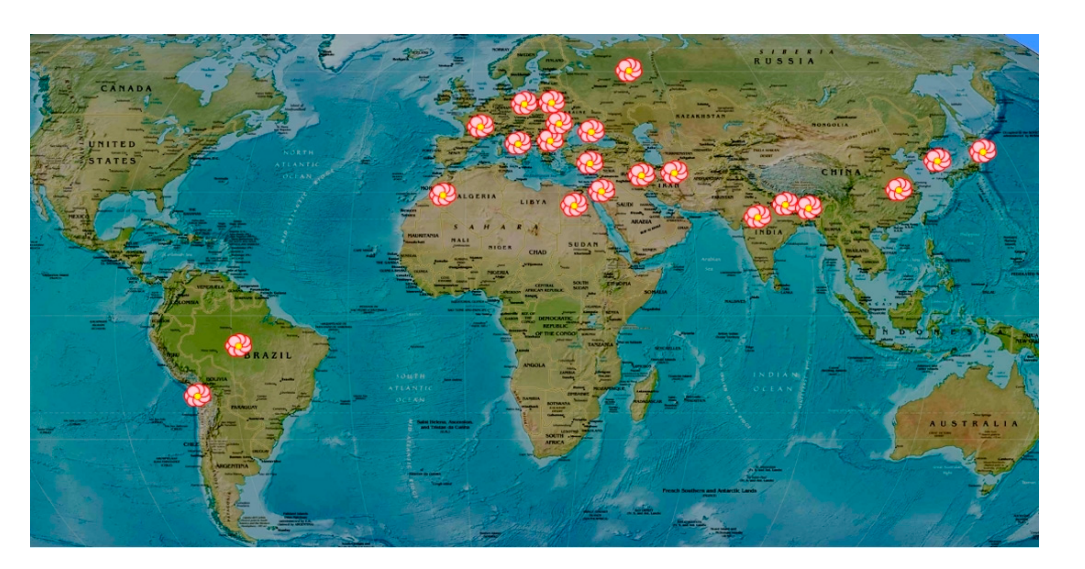
Figure 1. Main locations of rose habitats and producers of rose oils and their products worldwide.