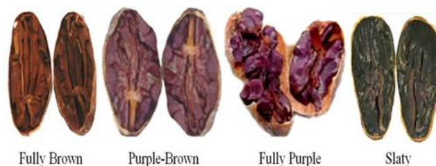
Fig. 2 Color of cut surface of dried cocoa beans