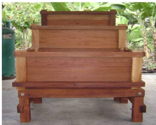
Fig. 1 Shallow box used in the experiment

Fermentation was carried out simultaneously in shallow box measuring 90 X 60 X 31 cm 3 for five days (Fig. 1) as described in [16] for all treatment. A total of 150 kg wet beans were loaded into each box and the mass was covered with gunny sack. The beans mass was turned at 72 hours by transferring from one box to another. Approximately 15 kg of fermented beans were taken randomly at the top, middle and the bottom layer of mass for duration of 0, 24, 48, 72, 96 and 120 hours fermentation, respectively. The beans were sun dried at one bean thickness on drying platform until the moisture content reduced to less than 7.5 per cent. Upon dry, each of samples were "quartered" down using quartering tools to approximately two kilogram each, labeled and stored in sealed container.