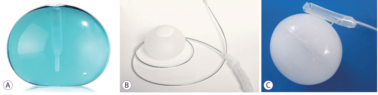
Fig 2. (A) Medsil<sup>®</sup>. <sup>39</sup> (B) LexBal (http://www.lexelmedical.com). (C) End-Ball (http://www.endalis.com).