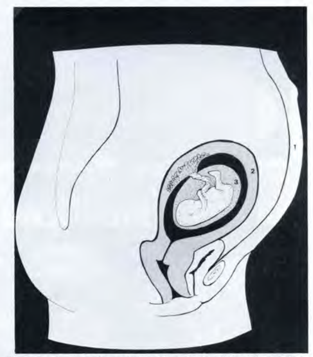
Figure 1. Drawing of a sagittal section of a female's abdomen and pelvis showing a fetus in utero. The "veils of darkness" are: (1) the anterior abdominal wall; (2) the uterine wall, and (3) the amniochorionic membrane.

"The three veils of darkness" may refer to: (1) the anterior abdominal wall; (2) the uterine wall; and (3) the amniochorionic membrane (Fig. 1). Although there are other interpretations of this statement, the one presented here seems the most logical from an embryological point of view.