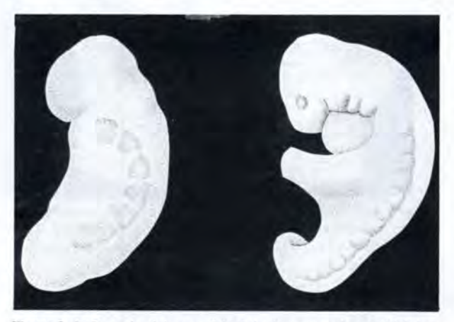
Figure 3. Left, a plasticine model of the human embryo which has the appearance of chewed flesh. Right , a drawing of a 28 day-old human embryo showing several bead-like somites which resemble the teeth marks in the model shown to the left.

"Then of that leech-like structure, We made a chewed lump."