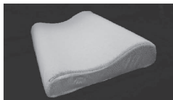
b. Memory foam pillow