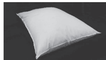
c. Feather pillow