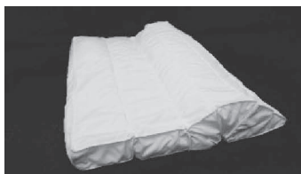
a. Orthopedic pillow

Values indicate mean (standard deviation).