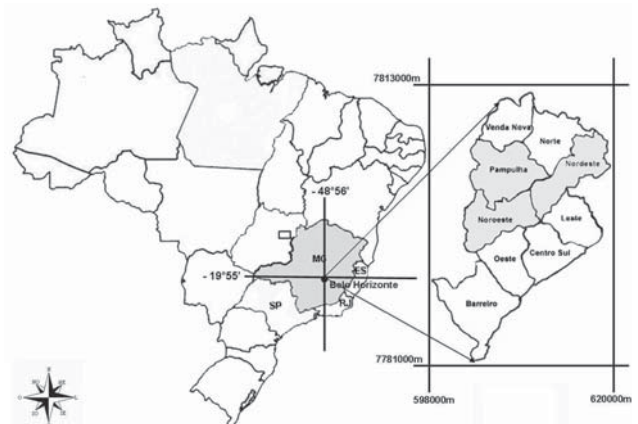
Figure 1. Location of the city of Belo Horizonte and its boroughs Pampulha, Nordeste, and Noroeste, Minas Gerais State, where samples of dengue virus serotype 3 viruses were collected during 2002–2004.

DENV-3 genotype 1 in Minas Gerais State is more likely to be imported from Asia because these isolates were closely related in the phylogenetic tree to the reference strain from the Philippines and China (15). It is difficult to determine the precise route of importation of DENV into Minas Gerais because the available data are limited. But one could speculate that the introduction of genotype 1 into Minas Gerais occurred in 2002, because this genotype had not been detected in that area before 2002. This study shows the emergence of a new DENV-3 genotype not only in Minas Gerais, but in the entire subcontinent, which is a matter for prospective public health studies.