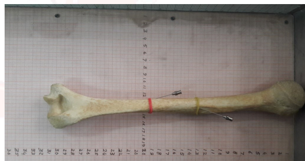
Fig. 3: Shows Measurement Of PI(Proximal Length) Of Humerus.