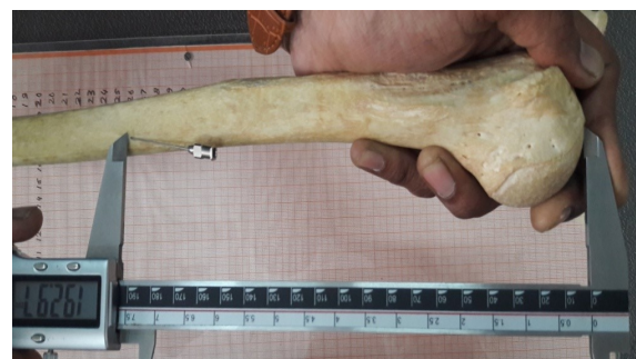
Fig. 4: Shows Total Length Of Humerus.