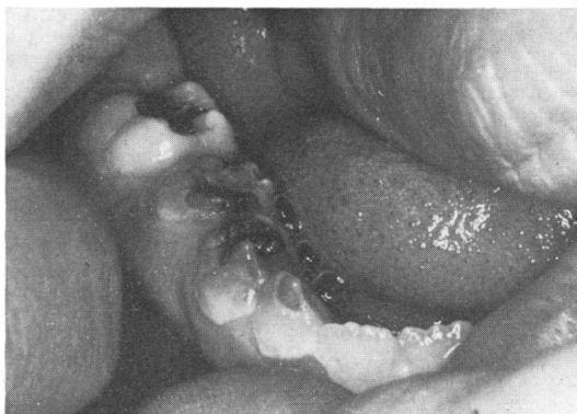
FIG. 2.—Enamel hypoplasia in an 8-year-old boy with congenital hypoparathyroidism.