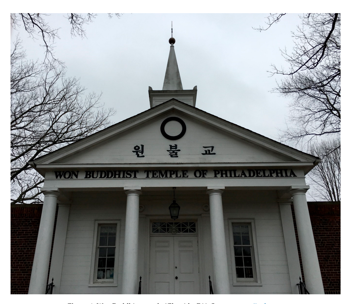
Figure 6. Won Buddhist temple (Glenside, PA).

As a non-traditional form of Buddhism originating in the early twentieth century, Won Buddhism has long modeled certain features of its habitus (e.g., priestly clothing, ritual activities, and music), as well as organizational structure after Christianity.<sup>43</sup> These choices were no doubt advantageous in the context of twentieth century Korea, as Christianity was closely associated with progress and modernity and Won Buddhism wanted to present itself as a modern and reformed religion. These same cues have now become regular, expected parts of Won Buddhist culture for its Korean adherents, both in Korea and in the US. However, the head minister of Philadelphia's temple appears to have thought that these Christian influences were undesirable in the local context. Perhaps they were seen as potentially alienating non-Korean Philadelphians who attend Won services with stereotyped expectations of what Buddhist practice will look like. In any event, the minister chose to downplay the Christian influences and to emphasize the "Asianness" of Won Buddhism's meditation practice.<sup>44</sup> These differences are not official Won Buddhist policy, but rather local strategic decisions about the use space, material culture, and aesthetics in order to send different cultural cues to different groups of local attendees.