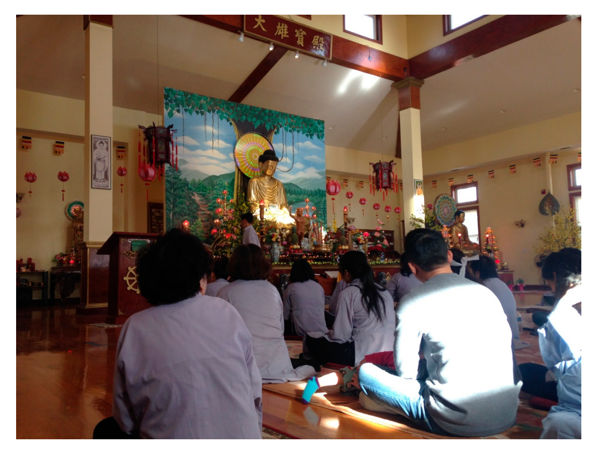
Figure 5. Main ceremonial hall at Chùa Giác Lâm (Lansdowne, PA).

Named after a pagoda in Ho Chi Minh City, Chùa Giác Lâm is located just beyond the city line heading west, in Lansdowne, PA. This Vietnamese Mahāyāna temple attracts many young families with various activities and clubs for children. As is the case with all Mahāyāna temples, the main hall at Giác Lâm is the scene of many ceremonies of blessing and healing (Figure 5). The community's healing rituals are typical, revolving around chanting and prayer dedicated to Mahāyāna deities, such as Avalokiteśvara and Bhaiṣajyaguru.