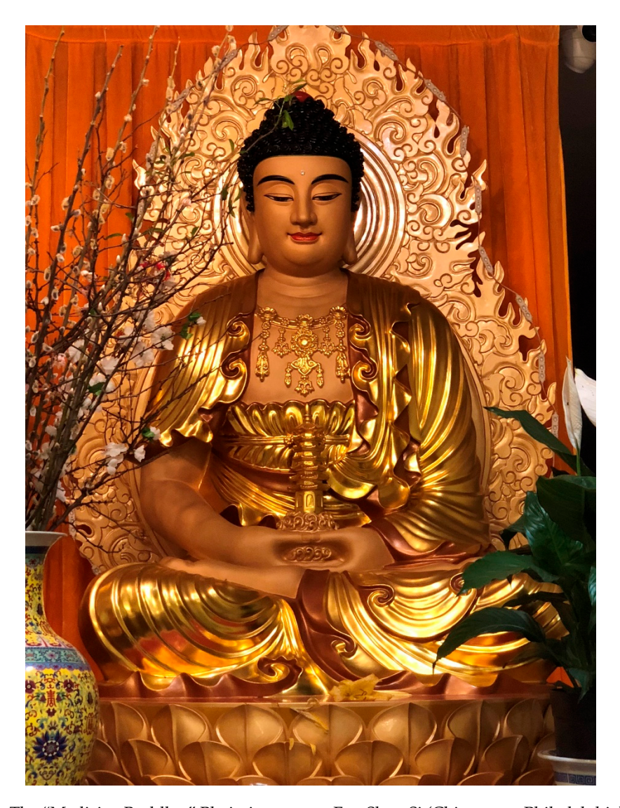
Figure 2. The "Medicine Buddha," Bhaiṣajyaguru, at Fou Shou Si (Chinatown, Philadelphia).

Aside from public rituals, private healing rites may also be commissioned for purposes of purification and protection. Such events can be arranged by individuals or families, and can be aimed at overcoming personal bouts of illness or other health-related misfortunes. In Mahāyāna temples, private healing rituals often consist of the same sorts of actions as might be done in a public ceremony—prayer, giving of offerings, and chanting—though now personalized for the family or individual patron. In some Theravāda and Vajrayāna temples, which tend not to hold public rituals specifically focused on healing, personal healing rites involve methods that are not normally conducted in public—such as spirit channeling, exorcism, or other esoteric activities. The officiants of such rites are typically monastics, although in some communities lay ritual specialists are also utilized.<sup>26</sup>