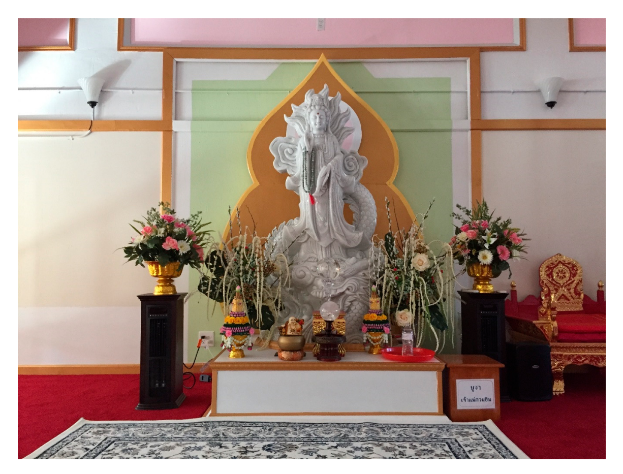
Figure 1. Avalokiteśvara (Th. Kuan Im), the savior-bodhisattva associated with compassion, at Wat Mongkoltepmunee (Bensalem, PA). Source: <a href="https://www.jivaka.net">www.jivaka.net</a>. All photos in this article were taken by project participants, and have been released to the public under the project's Creative Commons BY-NC-SA license.

the "Medicine Buddha," Bhaiṣajyaguru, known as Yaoshifo, Dược Sư, Yaksabul, or Menla (Figure 2).<sup>23</sup> In most Mahāyāna temples, rituals explicitly calling upon one or both of these deities for healing or protection from illness are incorporated into the standard devotional services that are held on a weekly basis. Some temples additionally organize annual or periodic events that bring together the community for special worship.