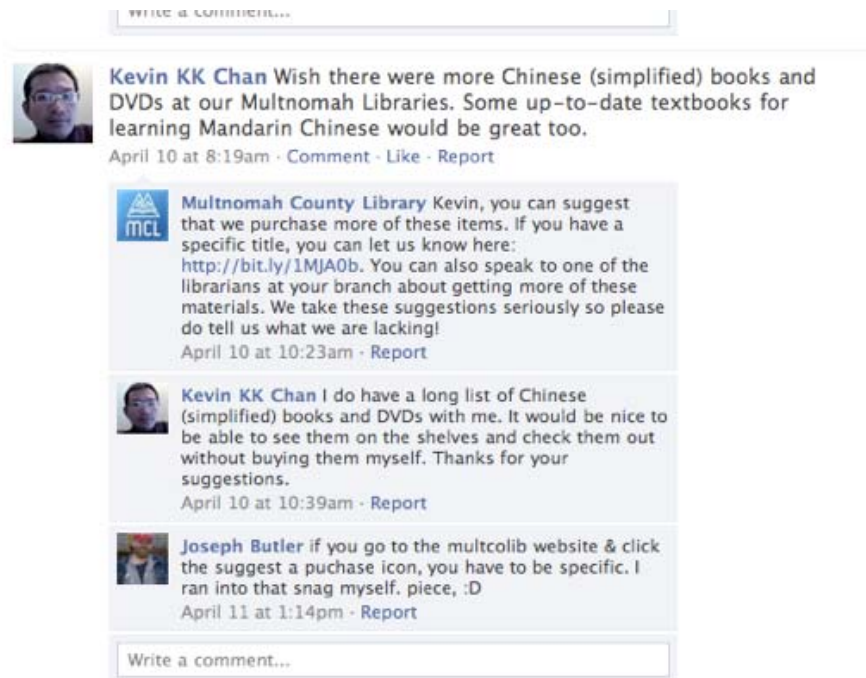
FIGURE 4 This Multnomah County Library patron directed a general material request to the library’s Facebook page. Note that the library addressed his question about two hours later, which is a great response time.

Next, the library needs to ask its community and itself the following questions: What social media do our users currently use? What are our users already saying about us via social media? Do we have time and people to dedicate to this? Are we committed to making this technology work in our library? What is our plan for promoting our presence online?