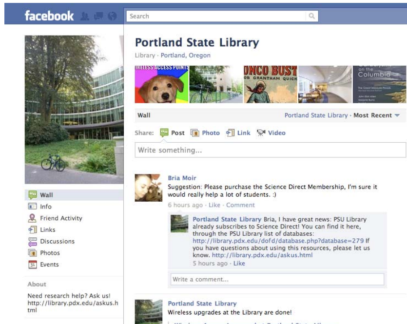
FIGURE 2 I created my library's Facebook page in January 2011, and we have a small but growing set of followers. This screenshot of the library's Facebook Page shows a collection request from a student for a database subscription, though one that we already have. Sometimes collection requests on Facebook can actually be reference transactions.

Many library patrons already are on Twitter and Facebook, and we should be too. Indeed, and perhaps most importantly, library patrons may expect their libraries to have a social media presence now that Twitter, Facebook, and other services are so ubiquitous. Thus, by having an active social media presence, we are fulfilling the expectations of some users, and finding users we might not connect with elsewhere.