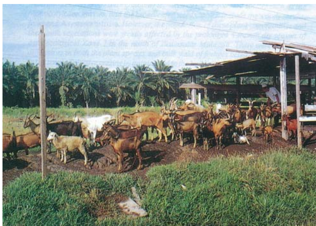
Plate 2. Integration of crossbred goats with oil palm for meat production in Selangor, Malaysia (C. Devendra).

It is important to keep in perspective the terms integration and integrated systems. Integration involves various components, namely crops, animals, land and water. Integrated systems refer to approaches that link the components to economic, social and ecological perspectives. The process is holistic, dynamic, interactive, multi-disciplinary and promotes efficiency in natural resource management (NRM). The integration of various crops and animals enables synergistic interactions, and result in a greater additive and total contribution than the sum of their individual effects (Edwards et al., 1988). Thus for example, swamp buffaloes in rice growing areas provide valuable draught power for land preparation, soil conservation and