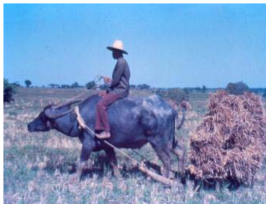
Plate 1. Integration and interaction of swamp buffalo with rice cultivation to provide draught power for land preparation, soil conservation and haulage operations are important functions in the Philippines and throughout South East Asia.

This paper is concerned with the significance and potential importance of integrated tree crop-ruminant systems and environmental sustainability. It emphasises their underutilisation, opportunities and unrealised economic benefits of integrated systems, status of advances in research and development (R and D) on the subject, relevance to other regions, ways of overcoming the major constraints and challenges associated with the environmental sustainability of the systems in the future. In