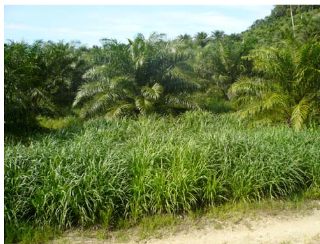
Plate 6. Oil palm cultivation and integration with ruminants also enables improved forage production, soil fertility and carbon sequestration as is reflected in the setting from Sarawak, Malaysia (C. Devendra).

Associated with above is the issue of greenhouse gas emissions (GHG), mainly CH 4 , N 2 O and CO 2 and their effects on climate change or global warming. Improved grass- legume pastures to feed grazing ruminants will have the beneficial effect of enhancing carbon sequestration and releasing more O 2 into the atmosphere (Plate 6). On the other hand, the presence of grazing ruminants will mean emissions of more CH 4 into the atmosphere, and their possible effects. In Brazil, Zebu cattle grazing tropical