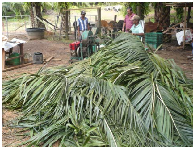
Plate 4. Oil palm leaves being machine chopped for feeding to cattle and goats in feedlots in Sabah, Malaysia (C. Devendra).