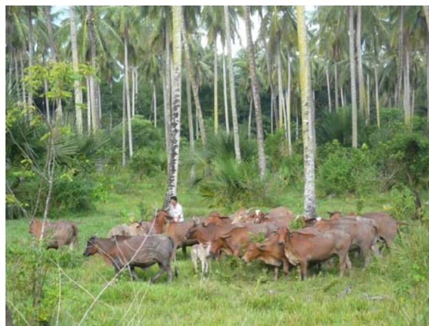
Plate 5. Integration of crossbred Sindhi cattle with coconuts in Sabah, Malaysia (C. Devendra).

Table 4 gives an indication of the nature of crop-animal interactions in ruminant in oil palm systems. The interactions can be positive or negative, depending on the type of livestock and trees, age of trees, and management systems. Among ruminants, cattle and sheep are well suited to integration with tree crops such as coconuts and oil palm. Sheep are more suited for integration with rubber where