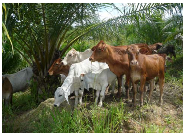
Plate 3. Integration of imported Hereford and Brahman cattle with oil palm in Sabah, Malaysia.