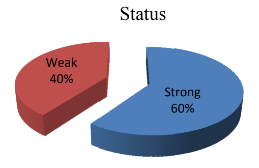
Figure 3. Status of the privacy statement