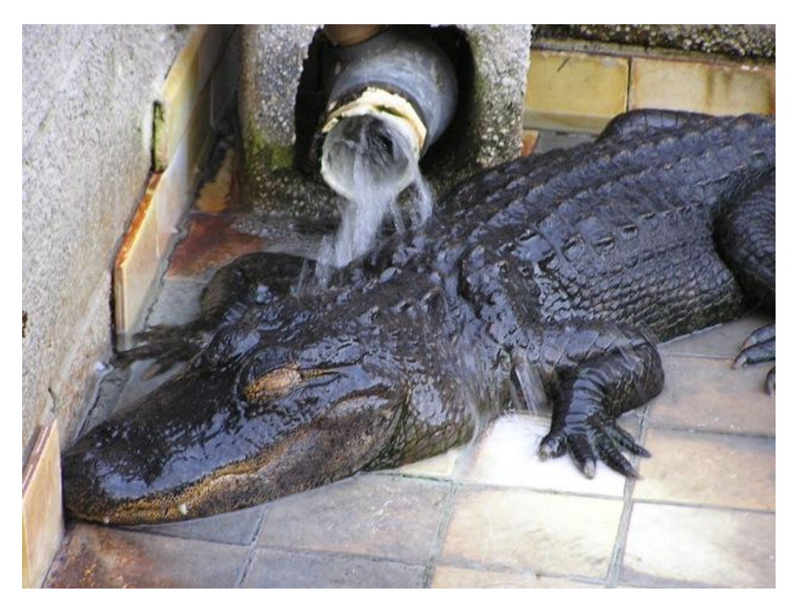
Figure 1. An American alligator (Alligator mississippiensis) resting after a bout of play with a stream of water, Saint Augustine Alligator Farm Zoo Park, Florida, USA.