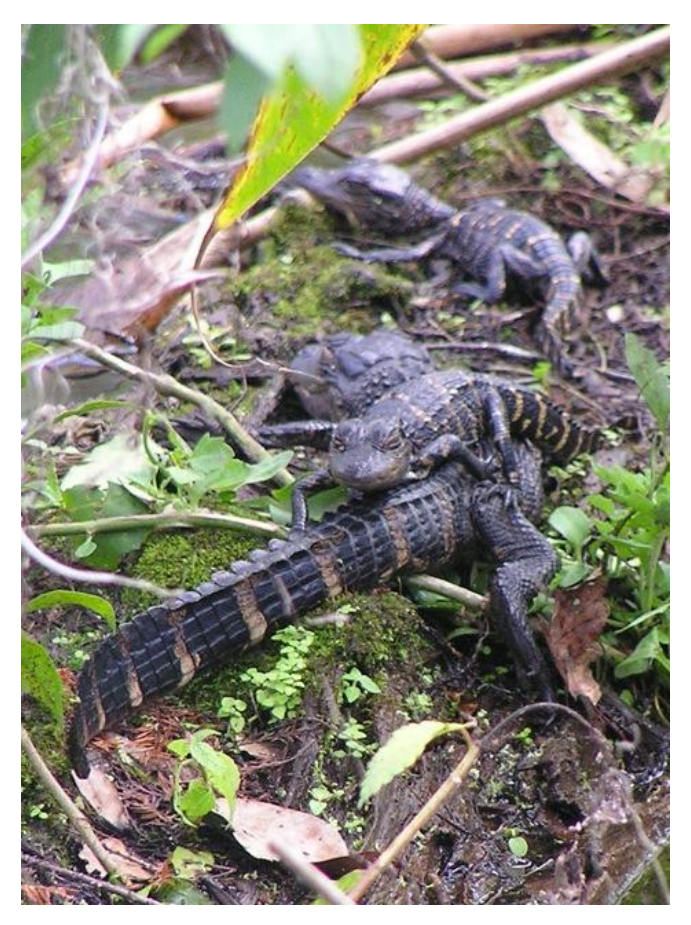
Figure 3. A hatchling American alligator (Alligator mississippiensis) riding on the back of an older individual in a multi-brood crèche, Fakahatchee Strand Perserve, Florida, USA.

An American crocodile ( Crocodylus acutus ), rescued and named Pocho by Gilberto 'Chito' Shedden, became a celebrity in Costa Rica for being absolutely tame and very playful with its rescuer.