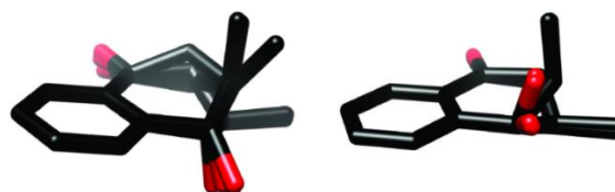
Figure 2. The solution conformations of compounds 2, to the left, and that of 3, to the right, as determined by combined theoretical and solution NMR conformational analysis (NAMFIS) for chloroform solution.