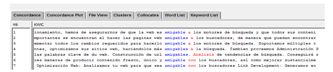
Figure 6: Results from a direct translation strategy: friendly/amigable

In the translation process, the trial-and-error search can again be of great help. Looking for equivalents of search engine friendly in the Spanish corpus, we gave it a try with the direct translation of friendly (amigable) with a confirmed outcome, e.g. amigables a los buscadores, amigables con los buscadores, amigable a los motores de búsqueda, as appears from the screen shot in figure 6.