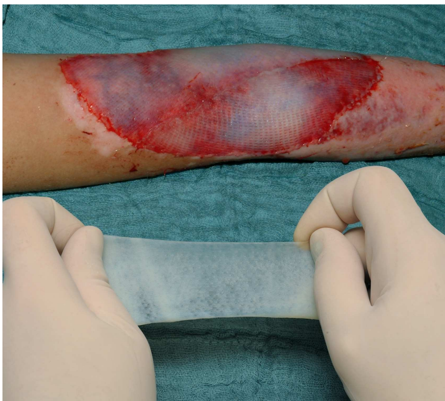
Fig. 2. Example of Glyaderm

This novel dermal substitute is called Glyaderm, which is an abbreviation for Glycerol-preserved Acellular Dermis. Before application of Glyaderm, the wound bed must show viable granulation tissue. In most cases, woundbed preparation with allogeneic donor skin is needed; in burns this takes about 7 days after debridement. Glyaderm is preserved in