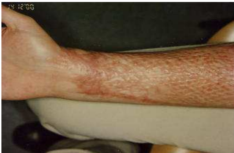
Fig. 1. Typical scar formation results after sandwich grafting, the mesh of the autologous skin graft pattern is still visible.