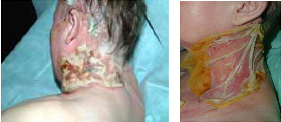
A: Burn wound before treatment