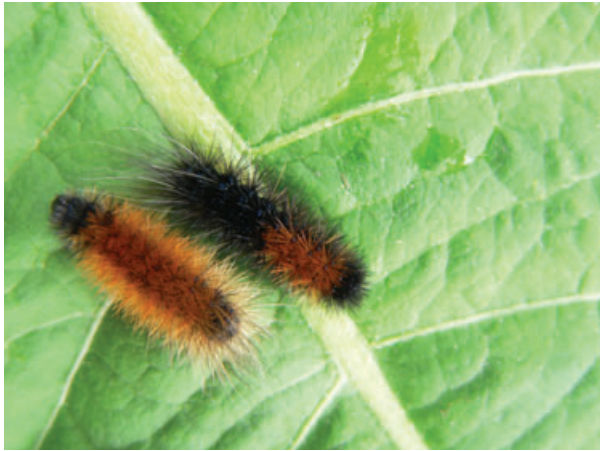
Fig. 1. Variation in the size of the orange patch and black pattern elements in aposematic Parasemia plantaginis larvae.