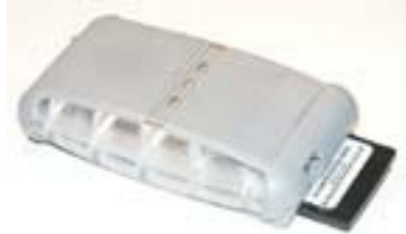
Figure 1. Fully-assembled.

Dilithium (see figs. 1 and 2) is a small, handheld computing device intended to be a test bed for applications that require neither a keyboard, pointing device, nor display. Combadge is a voice messaging application akin to AOL IM 2 , but embedded in an appliance-like device in which audio messages are recorded, transmitted, and played back. In this paper, we will use the term Combadge henceforth to refer to the Combadge application as embedded in the Dilithium device.