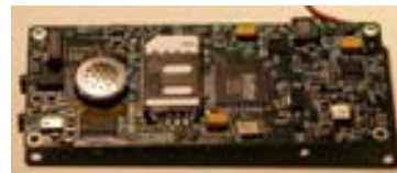
Figure 2. Front side of motherboard.

To demonstrate the use of these devices, imagine a sample interaction using Combadge by one user, Kirk, who wants to send a voice message to another user, Spock. Kirk would push the push-to-talk button on his Combadge and utter “New message for Spock,” then release the button. The Combadge would say, “Record your message for Spock.” Kirk would then push the button again and utter “We should meet on the bridge in five minutes,” then release the button. After each button press, the Combadge will acknowledge with a low-pitched beep and after each button release, the Combadge will acknowledge with a higher-pitched beep. After a brief delay, Spock’s Combadge will say, “You have one new message,” the five blue LEDs located under each of the translucent left and right side push-to-talk buttons will alternately flash, and the front left green LED will repeatedly flash