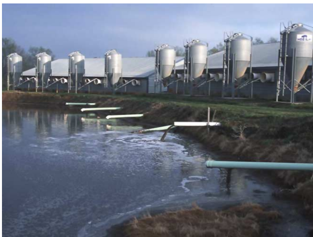
Figure 3 | Swine waste lagoon (Georgia, USA).

Despite the fact that levels of pathogens in animal waste can be equal to or even higher than levels found in human wastewater and sludge (Table 2) (National Research Council 2002; United States Environmental Protection