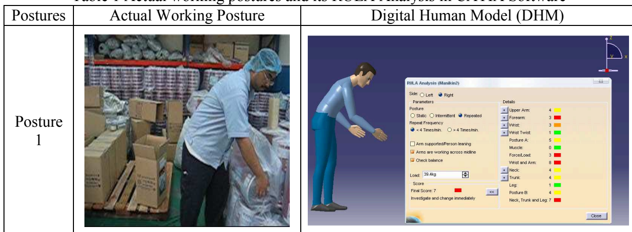
Table 1 Actual working postures and its RULA Analysis in CATIA Software

From the simple subjective evaluation and interview, it is shown that the subject is clearly experiencing posture discomfort during work. Five postures from the subject working cycle were recorded. The results of RULA analysis are shown in Table 1 for every postures involved. This analysis also shows the body segments that are having problems.