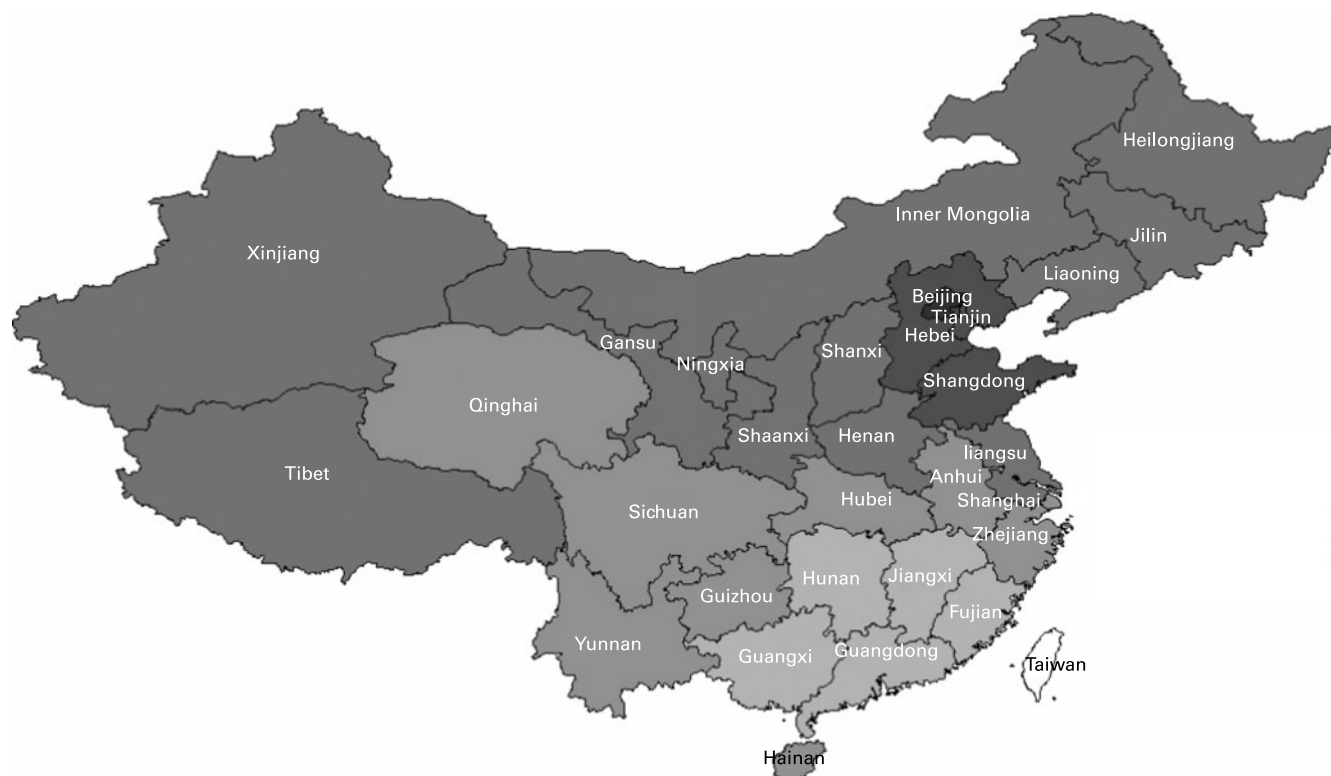
Fig. 2. BMI kg/m 2 in adults by regions in China. □, Missing or excluded; □, 20.00–20.99; □, 21.00–21.99; □, 22.00–22.99; □, 23.00–23.99; □, 24.00–24.99; □, ≥25.00. The South China Sea (Nan Hai) Islands are not shown on this map. The boundaries are only indicative and may not be accurate.

in the north ( r 0.871; 95% CI 0.660, 0.955) was stronger than that in the south ( r 0.489; 95% CI -0.056, 0.809). As expected, the prevalence of underweight was highest among the regions with low BMI, such as Guangxi, Jiangxi, Guangdong, Fujian and Yunnan.