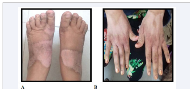
Figure 3 Faded plaques after two weeks of stopping carbamazepine.