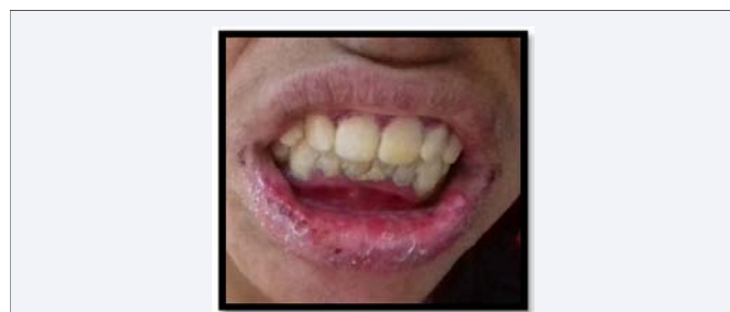
Figure 2 Oral mucosal fixed drug eruption with mild erosive lesions on the lower lip mucosa.