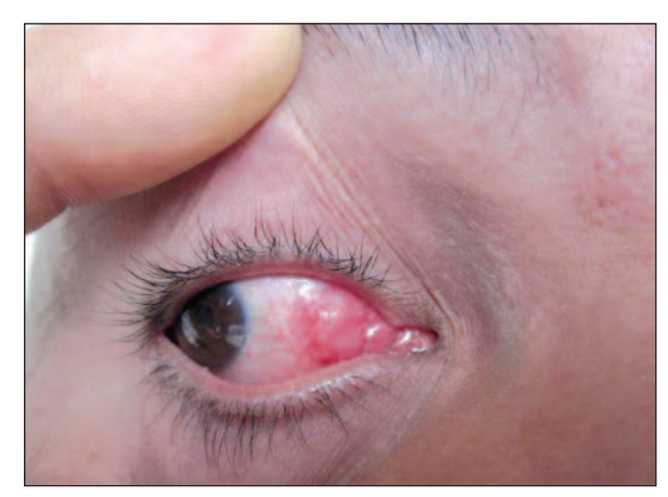
FIGURE 2: Granuloma at the nasal quadrant of the right eye about one month after first surgery.

month after our intervention, similar mass occurred on the medial rectus insertion as before (Figure 2), and surgical excision was applied with drainage of secretory material and a loosed non-absorbable suture removal. After surgery, topical medications were used.