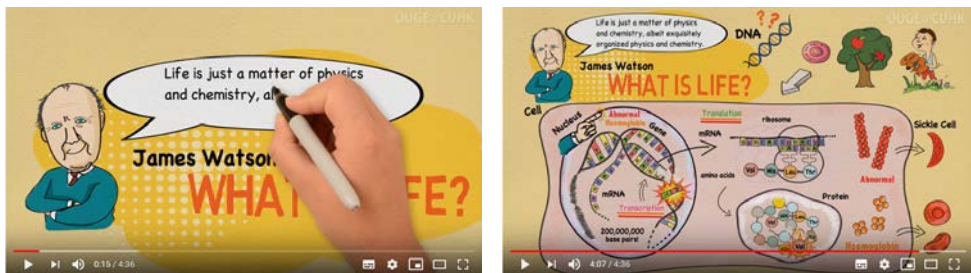
Figure 1. The whiteboard animation “What is life?” developed in this project. The left panel shows the drawing process of the illustrations. The right panel shows the big-picture.

Four whiteboard animations (“UGFN-animated”, 2018) were tailor-made to flip the classrooms in the common core science GE course according to Li et al. (2017). Each animation is about five minutes long in two languages (English and Chinese). The two animations, “What is life?” (Figure 1) and “Does DNA determine you?”, are related to the scientific inquiry of life and were designed to flip the classrooms of the tutorials discussing James Watson’s DNA: The Secret of Life . The other two, “Where does our mind come from?” and “Do we have free will?”, are related to the scientific inquiry of mind and were designed for the tutorials discussing Eric Kandel’s In Search of Memory .