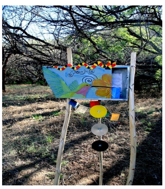
Figure 2. Tia Ballantine, poetry box along the Anza Trail near the Tumacacori Mission, Tubac, Arizona, 2015.

Ballantine, who organized the Green Valley Poets' Corner installation, POET-TREE for Flores' 2015 Poetry of the Wild in Tubac, Arizona, also feels that the position of boxes is important whether they are located in an urban or wild setting. "Placement depends on looking for the right spots ... determines the positioning to keep people going—not too far and not too close together" (Ballantine, 2015). Thus, the rhythm of walking and stopping aligns with the rhythm of the spacing and placement of the poetry boxes within the landscape (see Figure 2).