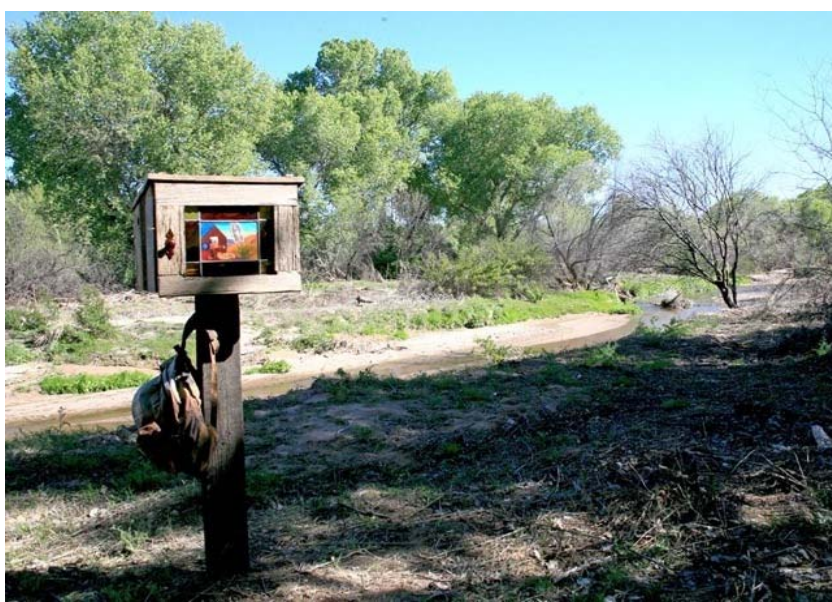
Figure 3. Ana Flores and Ed Wood. Poetry box installed on the banks of the Santa Cruz River near Tubac, Arizona, 2015.