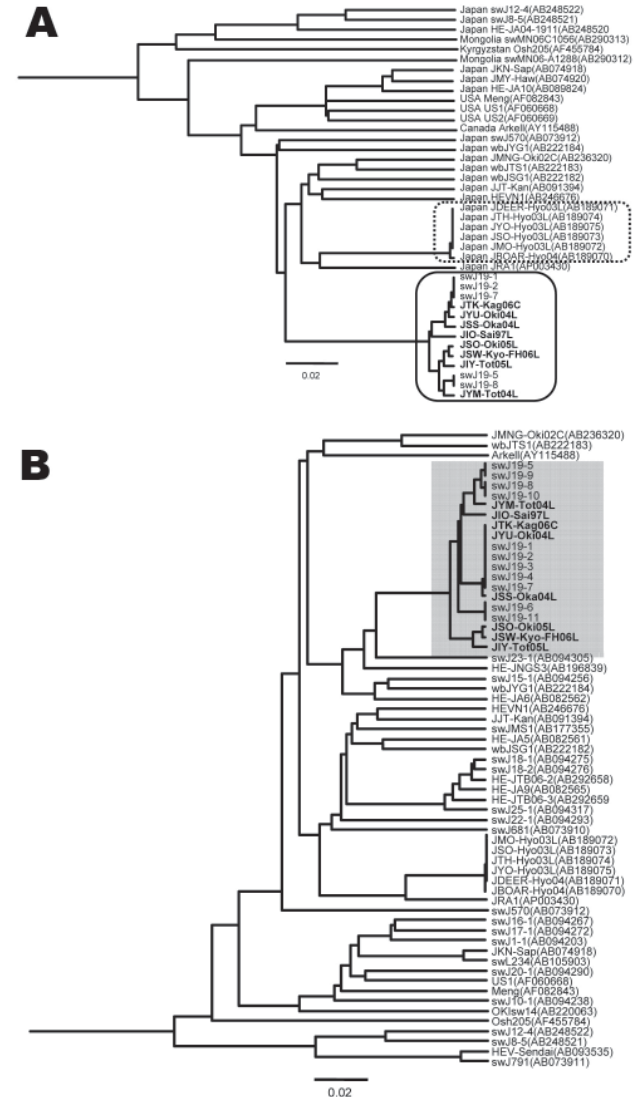
Figure 2. A) Phylogenetic tree (unweighted pair-grouping method with arithmetic means) constructed on the complete or near-complete nucleotide sequences of hepatitis E virus (HEV) genotype 3 isolates. Clustering of nucleotide sequences of 8 human patients infected with JIO strain of HEV and 5 swine infected with swJ19 strain of HEV is boxed by a solid line. Another clustering of local genotype 3 isolates from Hyogo Prefecture, Japan, is boxed by a dotted line. B) Phylogenetic tree (unweighted pair-grouping method with arithmetic means) constructed on a partial sequence of 412 nt in open reading frame (ORF) 2 (nt 5994-6405 of the US2 genome) of HEV genotype 3. Partial nucleotide sequences of 8 human JIO and 11 swine HEV swJ19 isolates (accession nos. AB094279–AB094289) are shown (shading). Analyses of full sequences of 5 of these 11 swine isolates were performed (swJ19-1, swJ19-2, swJ19-5, swJ19-7, and swJ19-8). Scale bars indicate nucleotide substitutions per site; boldface indicates isolates from humans.

(11). Unlike the JIO-related viruses, which were broadly distributed from the most southern to northern Japanese prefectures, HEV strains responsible for the infections in Hyogo Prefecture were not commonly found in other parts