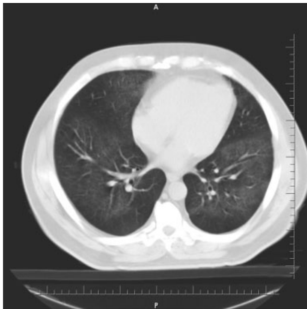
Fig. 2 Chest CT scan showing typical ground-glass attenuation of both lungs, suggestive of pulmonary paracoccidioidomycosis.

ventilatory distress, and his symptoms were less intense after corticosteroids, we decided to initiate treatment with itraconazole.