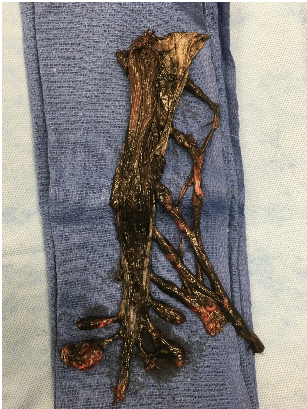
FIGURE 1: Tarlov cysts dissection.

themselves. As a cadaveric examination, the present study did not require approval by an ethics committee at our institution, and the work was performed in accordance with the requirements of the Declaration of Helsinki (64th WMA General Assembly, Fortaleza, Brazil, October 2013).