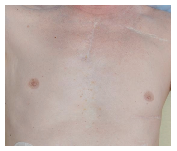
Fig. (3). Cosmetic result three years after minimal-invasive LVAD implantation.

Other approaches avoid sternotomy completely and place the outflow graft to other major arteries. Possible options are the subclavian artery, the innominate artery or the descending aorta.