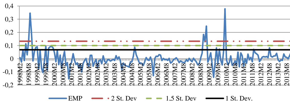
Figure 2. EMP index (KLR method)