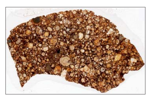
Fig. 1. Thin section of an ordinary chondrite found in the desert of Oman in 2010, showing the characteristic texture of densely packed chondrules. Image width is 37 mm.

Chondrites are the most common class of meteorites (Fig. 1). Their name-giving constituents are the chondrules, spherical bodies typically 0.2 to 1 mm in diameter (Fig. 2). They consist of partially recrystallized Mg,Fe-rich glass and are set in a finegrained matrix. Chondrites of the Ivunatype (CI) consist only of fine-grained serpentine matrix lacking chondrules. While the matrix of chondrites can be regarded as the most pristine leftover of the solar nebula, chondrules are drops of former silicate melt formed by melting of dust in the solar nebula. A third major constituent of many chondrites types is iron–nickel metal. After assembly to asteroids, chondritic material has undergone various levels of metamorphism ranging from weak recrystallization of glass to complete recrystallization and partial melting.