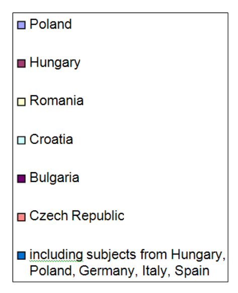
Figure 1. Distribution of the functional gastrointestinal disorders papers by country.