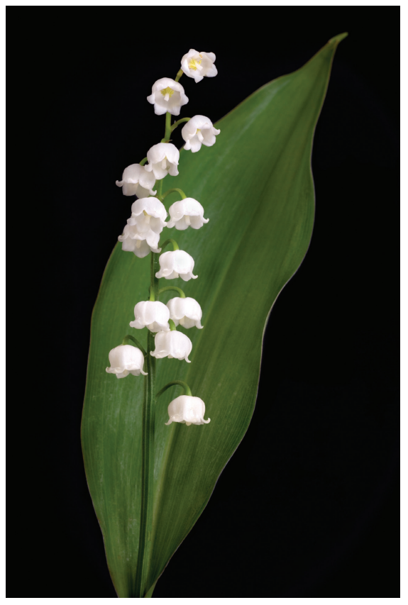
Convallaria majallis of the Liliacea family

The procyanidins found in Crataegus also inhibit phosphodiasterase,<sup>3</sup> the enzyme that degrades cAMP into inactive AMP. Since the breakdown of cAMP is prevented by Crataegus , calcium levels remain high; this leads to sustained myocardial contractility. While elevations in cAMP and intracellular calcium promote contractions of coronary