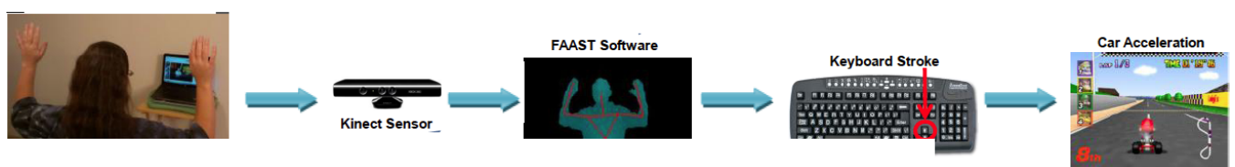
Figure 1: Process for converting participant's movements to VR activity.

The participant completed a VR intervention 3 times per week for 12 weeks, each session lasting 60 minutes. The participant lived approximately 2 hours from the Human Performance Laboratory, where a